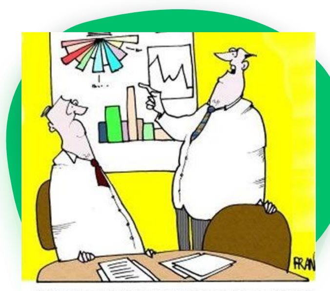
87% OF THE 56% WHO COMPLETED MORE THAN 23% OF THE SURVEY THOUGHT IT WAS A WASTE OF TIME